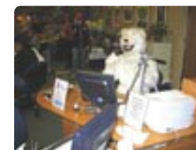
We're the IC and We're Too Cool!

Thank you for helping support this wonderful Library & Information Commons that allows ideas and innovation to flourish!